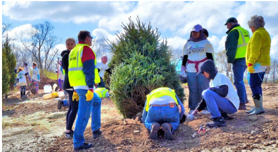
Tree Lafayette's annual Arbor Day was on April 28th, 2018 at the Crosser Softball Complex, where over 150 volunteers planted 50 trees. We'll be back there again for Arbor Day 2019 on April 27th to plant 60 more trees. Join us!