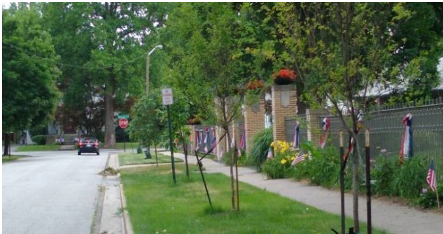
Earth Day trees on Seventh St,